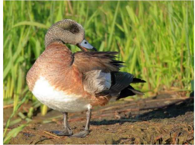
Figure 11 A drake American wigeon is a fine subject on a lake near my Idaho home. Had I been on shore, I would have been using continuous focus on the back-button. But in this case, I was offshore a little in my floating blind, so I moved the single AF point up and to the left till it was superimposed on the drake's eye and it focused the lens at that point.

Back-button focusing does take some getting used to. But once it's use becomes second-nature, you will have greater control over your auto exposure systems. But, don't abandon focus on the shutter button or manual focus. In certain situations, focus on the shutter button, manual focus, and back-button focus all work best.