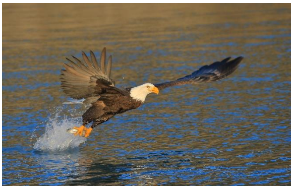
Figure 9 A bald eagle has just grabbed a fish thrown by a fisherman in Alaska. More than fifty eagles were circling the boat because they knew more fish were coming. All the photo chances were flight shots, so it makes sense to put continuous focus on the shutter button to eliminate the need of also holding in the rear button focus control.

Many photographers adopt back-button focusing and then say they use nothing else. That is a big mistake! When photographing subjects where there is only action, I see no benefit in back-button focusing. After all, you must hold the back-button in while pressing the shutter button, and that is one more thing to do. It is reasonably easy to do, but why bother if the subject is always moving so the camera must always be focus tracking.