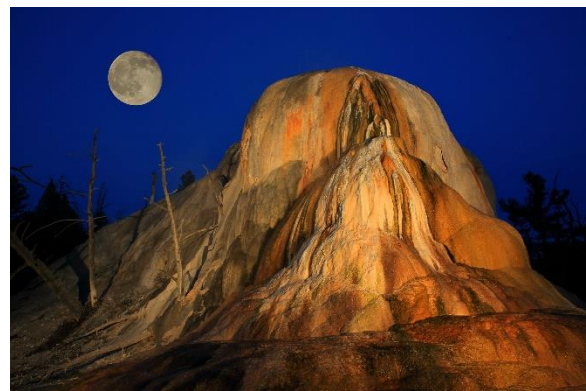
Figure 3 Night photography is very low light shooting. Autofocus generally does not work at night, so using live view, and manually focusing both orange spring mound in Yellowstone and later adding the moon to the image with the double exposure technique works best. Both the mound and the moon are manually focused on at separate times.