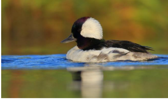
Figure 10 My floating blind is too cramped to use back-button focusing. I therefore use continuous autofocus on the shutter button and quickly move the single active AF point around to make it coincide with the head of this bufflehead.