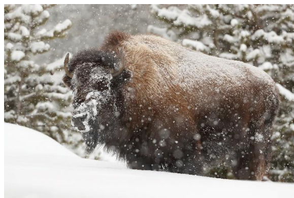
Figure 7 The snow falling in front of this Yellowstone bison made it impossible to hit sharp focus with autofocus. Manually focusing the lens while using a magnified live view image works far better.

Autofocus requires contrast to focus accurately. If you point the camera and lens at a subject that is very low in contrast, such as a field of snow on an overcast day, clear sky, or any uniformly-toned subject, the contrast could be so little that autofocus isn't reliable. And in falling snow, the focus does try to work, but the focus jumps back and forth as it detects snow at different distances. I photograph plenty of bison in the falling snow when leading my Yellowstone Snowcoach photo tours and the best way to hit sharp focus on the face when heavily snowing is to use a magnified live view image and manually focus on the eye of the bison.