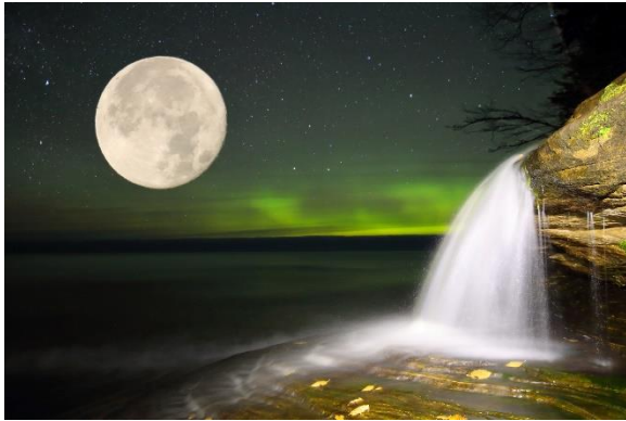
Figure 8 Night sky photography requires manual focus due to low ambient light levels where autofocus does not work. This is Elliott falls on Miner's Beach east of Munising, Michigan.

foreground and manually focus the lens on the now illuminated foreground.