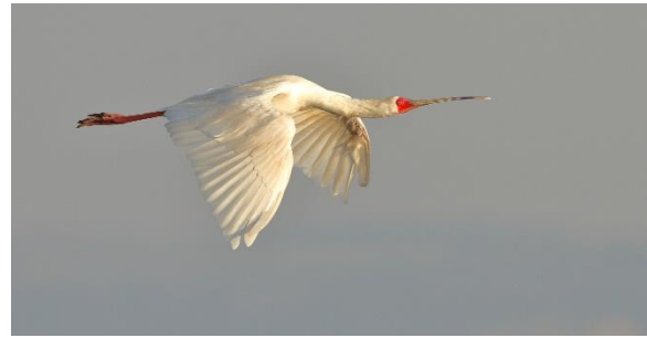
Figure 2 African spoonbills are interesting birds as they filter the water finding their food. I found a flyway between two ponds in Kenya where they flew back and forth. Since they were always flying and continuous focus was the only option, setting the camera so autofocus is on the shutter button is perfectly sensible. In action only situations, I do not use back-button focusing.

Modern cameras offer numerous AF points to help you achieve sharp focus. That is a good thing! However, often using all of them at once, whether 61 or some other number, will let the camera focus on the wrong spot. Autofocus systems typically focus on the closest object, and when your main subject, perhaps the face of the lion or a particular tree or rock in a landscape is not the closest spot, this causes a problem. Fortunately, cameras let you choose how many AF points you want to use and where they are located. You can choose all the AF points, a small group in one spot, or even a single AF point. There are many combinations to select. Notice in the discussion to follow that I refer to the active AF point(s) and not the ones that are disabled with camera selections.