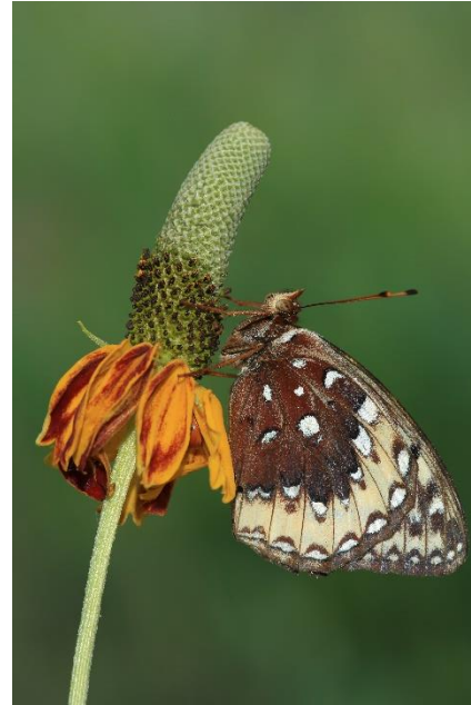
Figure 5 Close-up photography really demands precise focus on the scales of this great-spangled fritillary. The best way to achieve the ultimate in sharpness is to use a tripod, trip the camera with a cable release, and especially use live view at 10x magnification to make it easy to manually focus on the wing's scales next to the thorax.

Photographing tiny subjects that require magnification from around 1/5 life-size and greater really focus better when manual focus is used. Depth of field is limited as magnification increases. Often it is crucially important to precisely focus on a tiny specific spot on the subject such as the scales on a butterfly's wing or the stamens protruding from a flower.