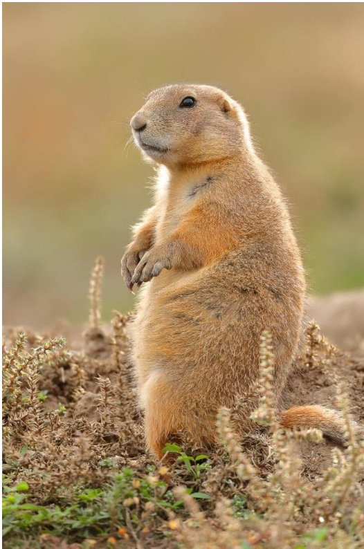
Figure 4 This black-tailed prairie dog is holding quite still now, so single focus or continuous focus works well if the active AF point is on the "dogs" face. But, should it begin to run, then you must have continuous focus immediately or it is too late.

remains, even if during the final composition the AF point coincides with a part of the foreground or background.