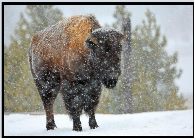
Figure 1 Snow obscures the steam in thermal basins, but it adds mood to a dark furry bison. When it is snowing this hard, autofocus has difficulty hitting sharp focus on the bison's face. We will teach you how to sharply focus the bison.