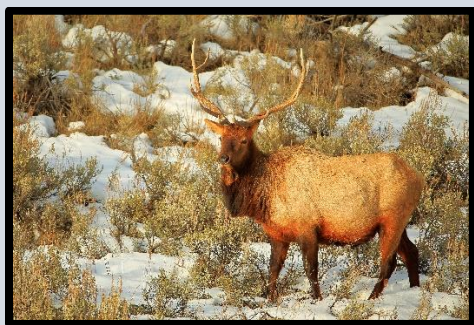
Figure 11 We sometimes find large bull elk in winter!

A deposit of $500 per person is required to hold your space. 50% of the deposit is refundable. All remaining unpaid balances are due in full 45 days prior to the start of the tour. 50% of the total package is refundable up to 15 days before the beginning of your tour.