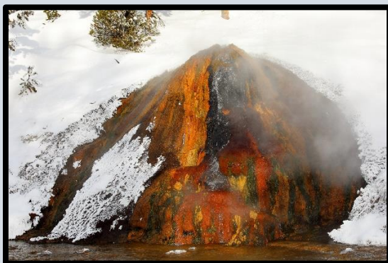
Figure 8 Chocolate pot is a colorful hot spring that few visitors to Yellowstone ever see, but you will photograph it.

Please tip the restaurant staff for your morning meal. We will collect tips for the snowcoach drivers who work extra-long days on our behalf. Budget 20 dollars per day for the coach driver. Dixie and John do not accept tips.