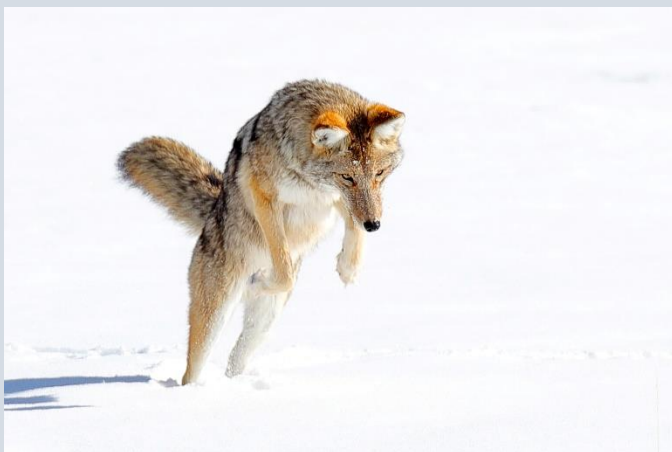
Figure 14 A coyote leaps to pin down a vole in the soft snow.

Be sure to read our detailed article on photographing Yellowstone in winter that is posted on my blog at www.gerlachnaturephoto.com