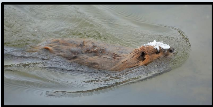
Figure 4 A beaver is busy gathering food along the Yellowstone river in Hayden Valley.

of steam on cold winter days. The billowing steam created when superheated water clashes with frigid winter air is awesome! In the geyser basins, snow and hoar frost cling to every tree and that photographs beautifully against cobalt blue skies. Scenes we'll photograph include the magnificent Grand Canyon of the Yellowstone from Artist Point, several spectacular waterfalls that include Firehole, Gibbon, Lower, Upper, Kepler Cascades; plus, geysers, fumaroles, and the mud pots at Fountain Paint Pots. We spend all our time pointing out outstanding subjects to photograph while helping you use your equipment to best advantage.