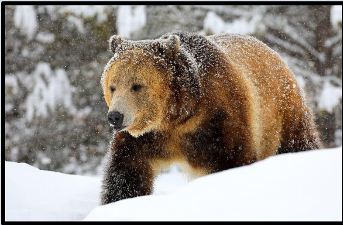
Figure 10 We spend one morning at the Grizzly Bear exhibit in West Yellowstone. Both bears and wolves are active during your trip.

We made the tour price as complete as possible. However, items of a personal nature, alcoholic drinks, transportation to and from West Yellowstone, and your personal Yellowstone National Park pass are not included in the tour price.