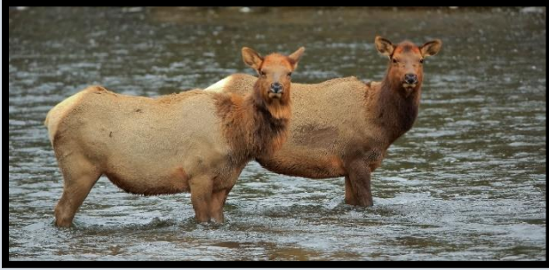
Figure 3 These cow elk stand in the river to avoid predation by wolves and eat grass along the banks.

around 5:30 pm. No other photo tour gives you more time in the park than we do!