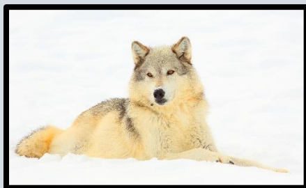
Figure 6 A gray wolf at the center.

When the weather is most favorable, we visit the nearby Grizzly Bear and Wolf Discovery Center that is close to the Three Bear Lodge where we stay in West Yellowstone. Both bears and wolves are active during winter at the center. The wolves offer especially good opportunities for close-up images of their faces. Admission to the center is included in your tour package.