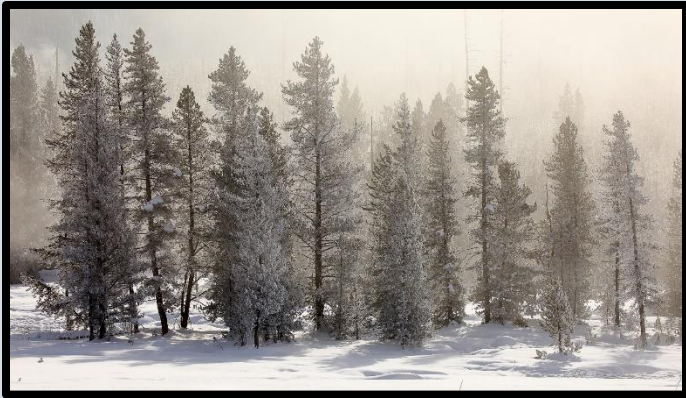
Figure 9 Heavy frost on the lodgepole pines makes this a mysterious landscape in Elk Meadows.