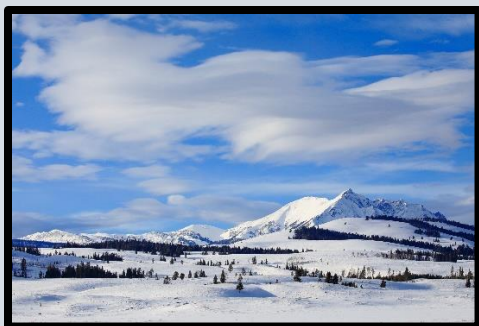
Figure 13 The valleys in Yellowstone are pristine in winter.