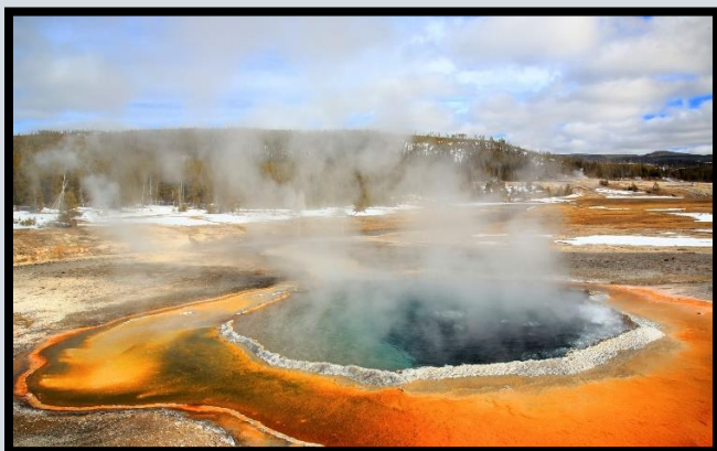
Figure 2 Crested pool generates more steam when temperatures are cool. A 16-35mm lens nicely composes the scene.

We enjoy the comfort and safety of a snowcoach to explore and photograph the winter wonders of Yellowstone National Park during this quiet and magical time of the year. John has lived next to Yellowstone since 1993. During that time, he has led over 100 five-day winter photo tours in this magnificent park. Nobody has more experience and enthusiasm for leading photo tours while teaching cutting-edge photography techniques during winter in Yellowstone. Please join us for five full days of intensive photography in the interior of Yellowstone. Come join like-minded nature photographers and be inspired by the incredible scenes found throughout the park.