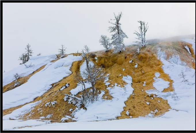
Figure 5 Palette Spring in the fog