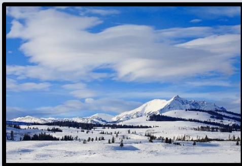
Figure 13 The valleys in Yellowstone are pristine in winter.

Please charge the credit card indicated for a total amount charged of $_____