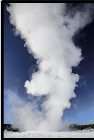
Figure 7 Old Faithful erupts against a cobalt blue sky. If the sky is white with clouds, the shape of the geyser is hard to see. On the first sunny days, we photograph in the geyser fields.

Breakfast is served at 6:30 a.m. at the hotel. We board the snowcoaches by 8:00 am and drive the short distance to the park where we stay out all day and return to West Yellowstone late in the day around 6pm after sunset. We do try to photograph sunset whenever possible. We have paid for extended snowcoach hours, so we don't have to return as early as other tours. We return to the hotel in West Yellowstone only when the light fades away.