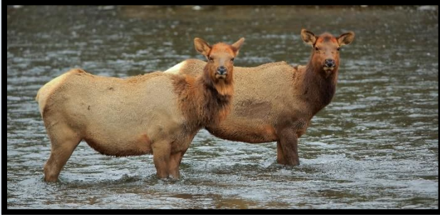
Figure 3 These cow elk stand in the river to avoid predation by wolves and eat grass along the banks.

around 6pm. No other photo tour gives you more time in the park than we do!