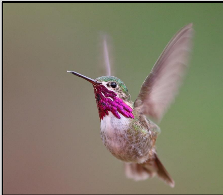
Figure 13 The male calliope hummingbird hovers above a hum-button. Bright overcast light brings out the color.

https://www.flickr.com/photos/142501139@N02/