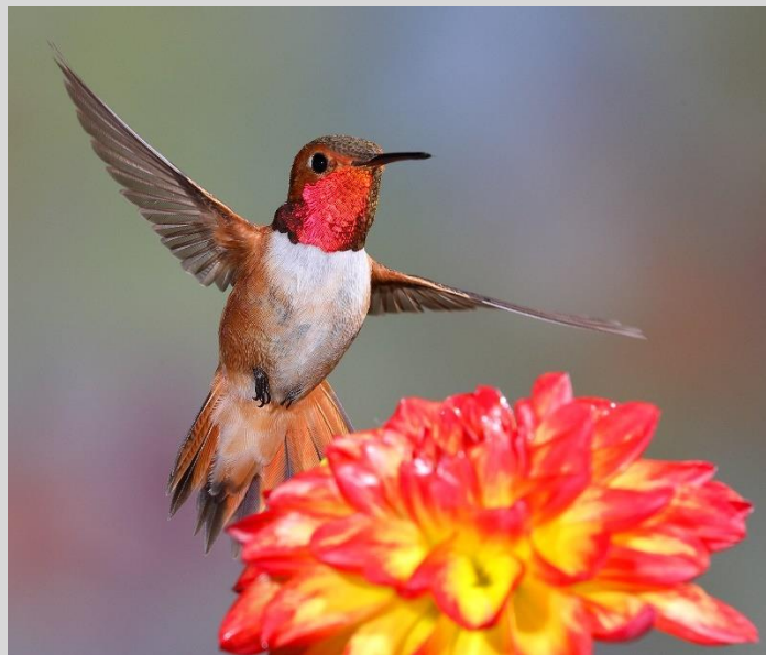
Figure 17 The protective male rufous awaits you. We call him the "red baron" and you will likely find out why!