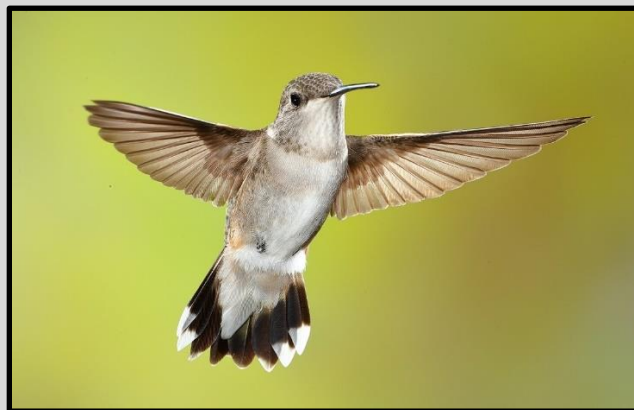
Figure 11 The lady black-chinned hummingbird is the most elegant of the ones we have at Bull River. She is sweet, does not fight, and continually spreads her tail and flips her wings producing a higher percentage of nice poses than all others. Notice I made the backlight flash stronger to make the wings glow more!

Non-photographers are encouraged to attend the workshop. The cabins and the bunkhouse are wonderfully comfortable, and the porches are great for enjoying the view and hummingbirds. Bull River is a magnificent place to enjoy nature, read, or relax. Many non-photographer spouses join us, all have a splendid time at Bull River, and may participate in the activities during the week. Non-participants do not photograph hummingbirds on the flash stations as those are reserved for participants.