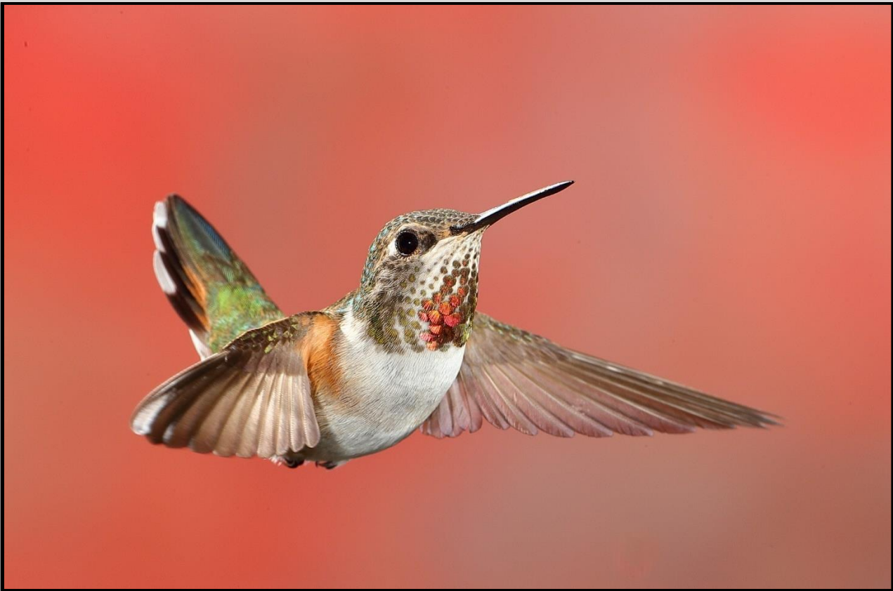
Figure 10 Editing thousands of images takes time. John teaches how he sorts through several hundred images per hour to find the best! The wings and body position make this a pleasing pose of a female rufous hummingbird.