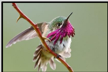
Figure 4 Calliope Hummingbird

The three species of hummingbirds living at Bull River are the adorable calliope (45%), crimson rufous (45%), and charming black-chinned (10%). During the workshop, you shoot numerous images of all three - males and females alike. As the breeding season is happening, all are wearing striking breeding plumage!