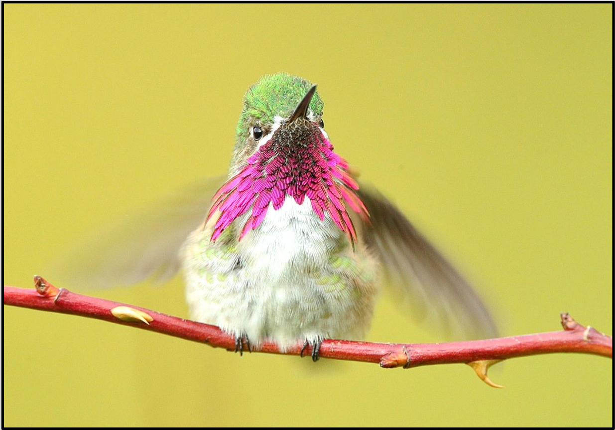
Figure 8 This male calliope hummingbird "owned" a group of bushes that he vigorously protected from all others. Using natural light, my group members shot at least 20,000 images of him from ten feet away. I shot this image with a Canon 600mm lens, 1.4x teleconverter, and 25mm extension tube. The whole combo is AF microadjusted to +5.

Depending on your gear, you may need an extension tube of about 25mm to focus close enough.