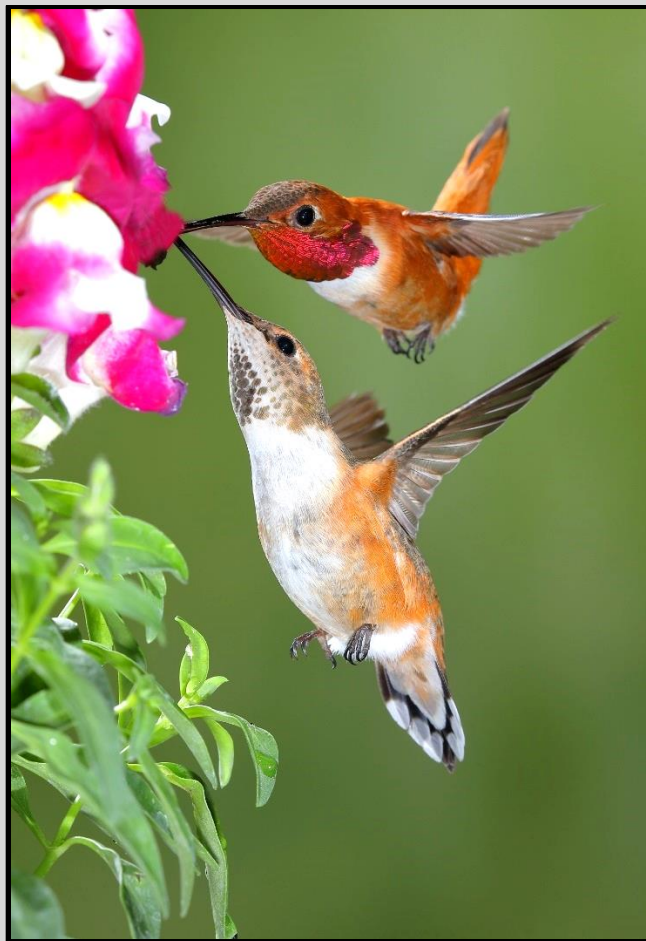
Figure 3 In the evening, often two hummingbirds visit the feeder simultaneously! Here is a pair of rufous hummingbirds sharing the feeder! Surely you would like to make similar images!

Hummingbirds are site specific. They fly the same migration pattern year after year and return to the Bull River Guest Ranch each May. Their arrival time only varies by a day or two. Most of the hummingbirds arriving at Bull River already know my photography stations and are comfortable with humans and flashes. In the evening, hold your hand over the feeder perches and soon hummingbirds perch on your hand. John Gerlach holds the record with 9 hummingbirds perched on his hands at once! Feel free to attempt a new record!