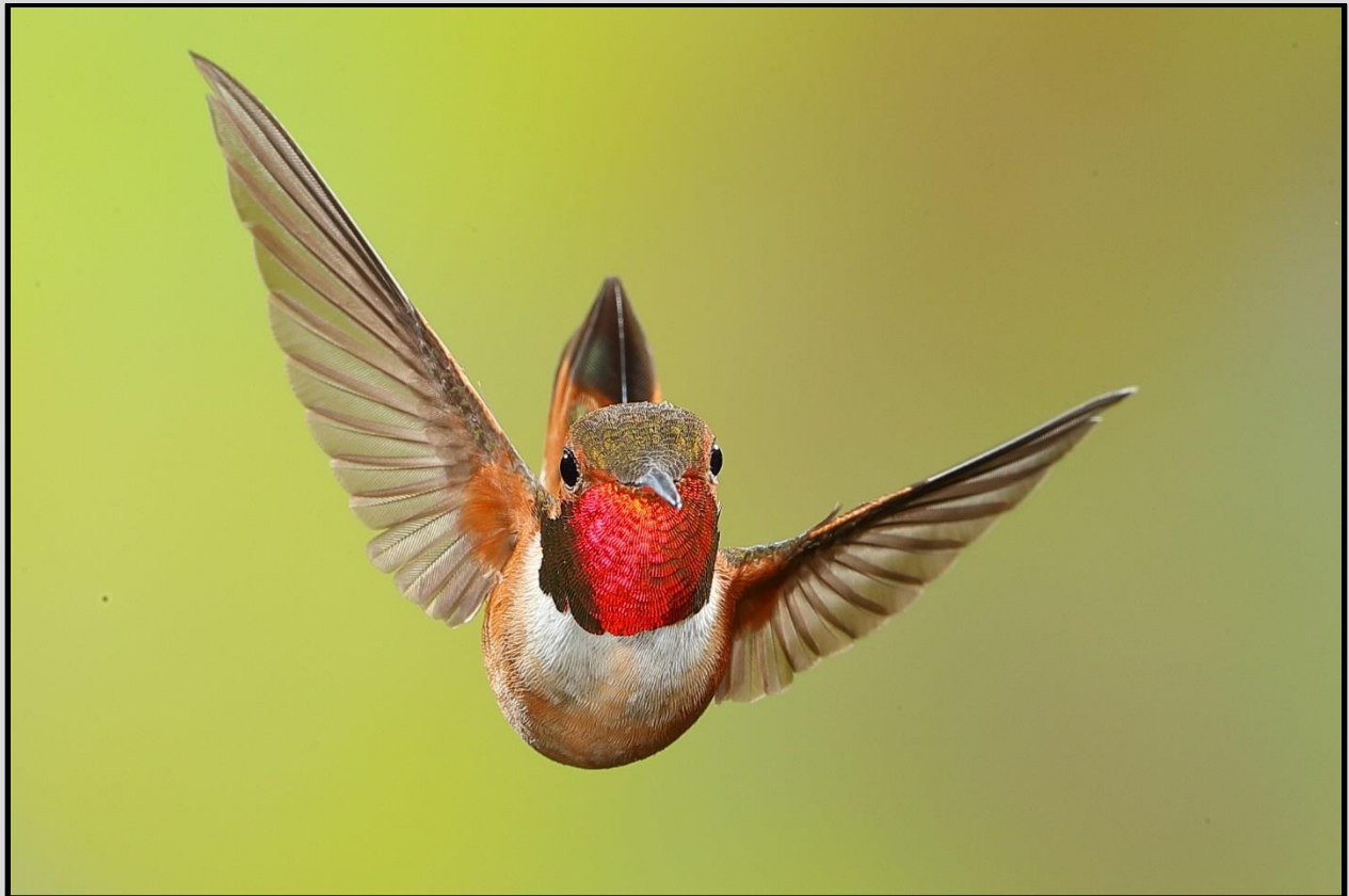
Figure 1 The male rufous hummingbird dives in to sip sugar water. By shooting thousands of images, capturing a pose like this is possible. This action is so fast that you don't see this pose until you view your images.

With John Gerlach, Dixie Calderone, and Scott Bechtel