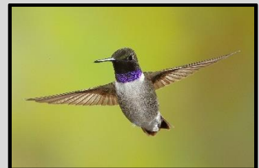
Figure 6 Black-chinned Hummingbird