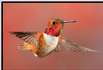
Figure 5 Rufous Hummingbird