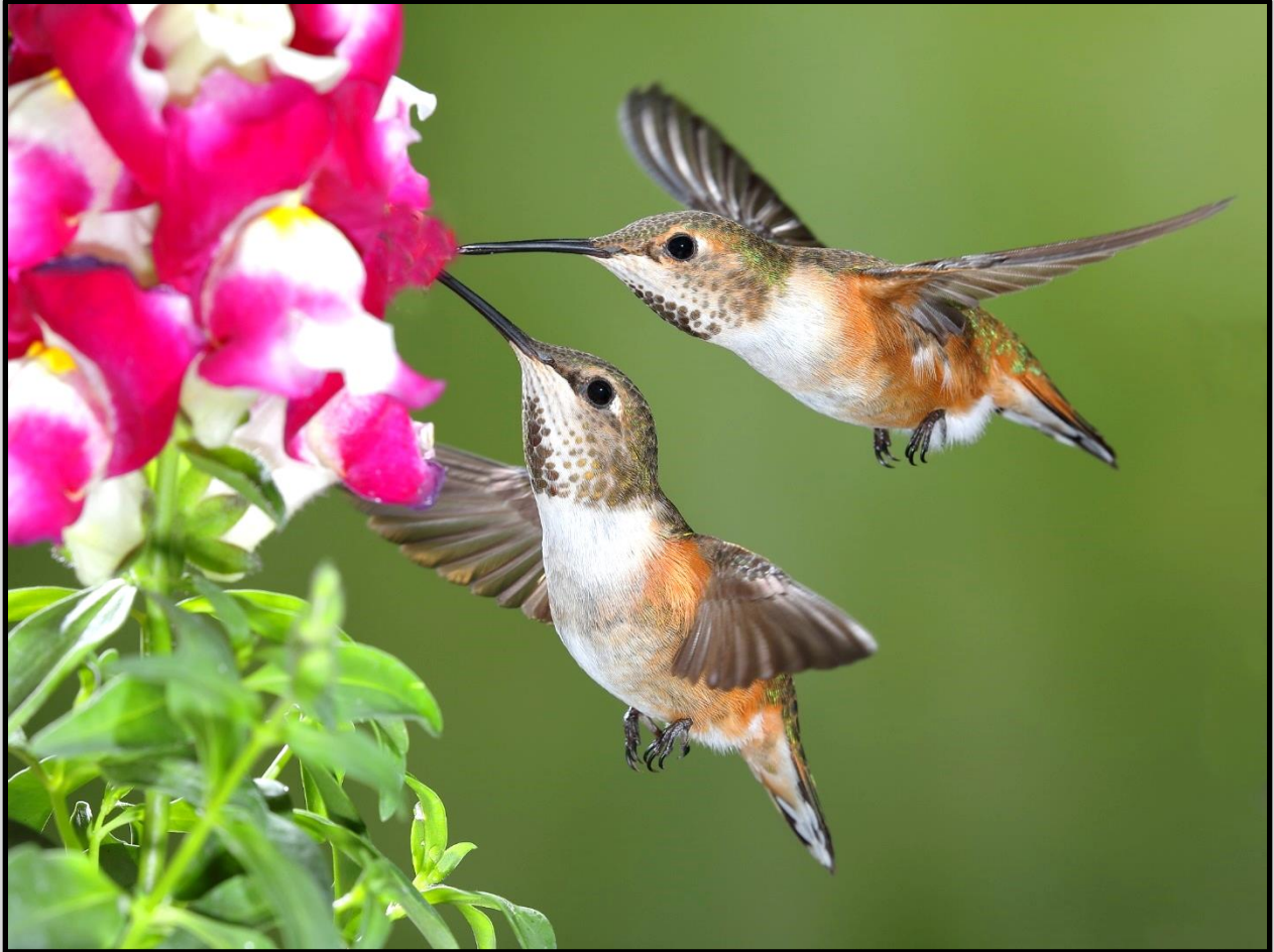
Figure 14 Two female rufous hummingbirds share the same feeder that is barely hidden behind the flowers. For this image a zoom lens is handy! I am set up at 400mm for one bird at the feeder and zoomed to a slightly shorter focal length to accommodate two birds!