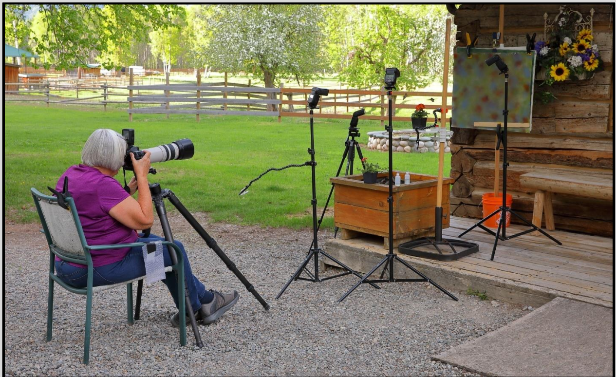
Figure 12 A workshop member photographs hummingbirds with four flashes, a hummer feeder hidden behind flowers, and a background. I think you should be in that chair next year. Can you see the two hummingbirds buzzing around her setup? Look between the fence boards just to the right of the flower for one, and the second is to the immediate left.