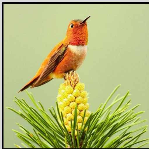
Figure 2 In addition to multi-flash, enjoy natural light opportunities. This male rufous hummingbird perched on everything we put out for him and he let us photograph him from only a few feet away!

I did not expect to find an exceptional place to teach hummingbird photography in southeastern British Columbia. It all began while leading a polar bear photography tour in 2002. During a relaxing evening with my group, the conversation drifted to hummingbirds. One of my participants said, “my husband and I own the Bull River Guest Ranch that attracts hundreds of hummingbirds in May and June. The birds flock to our guest ranch to feed at the sugar water feeders, and at dusk, every feeder is swarming with hummingbirds like bees at a hive.” That statement started all this!