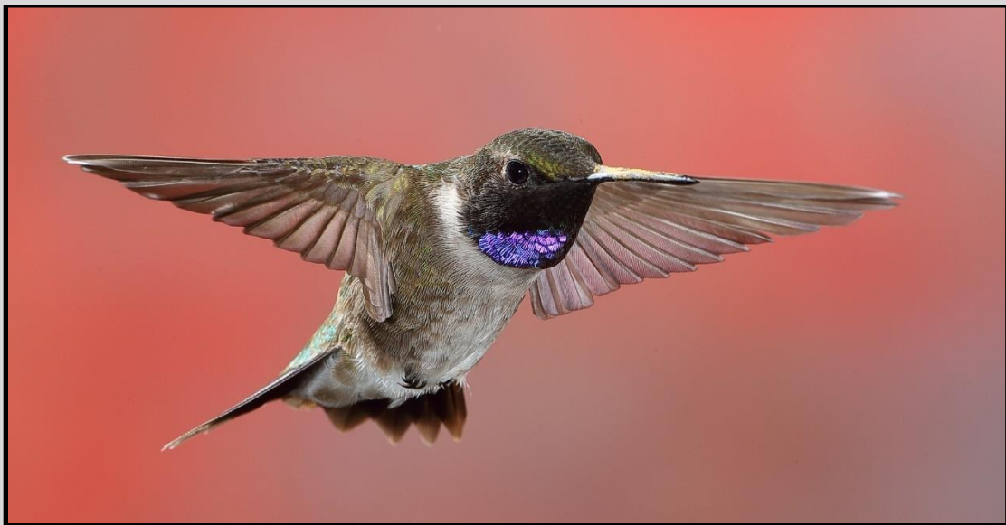
Figure 15 The male black-chinned hummingbird has some color on the throat.