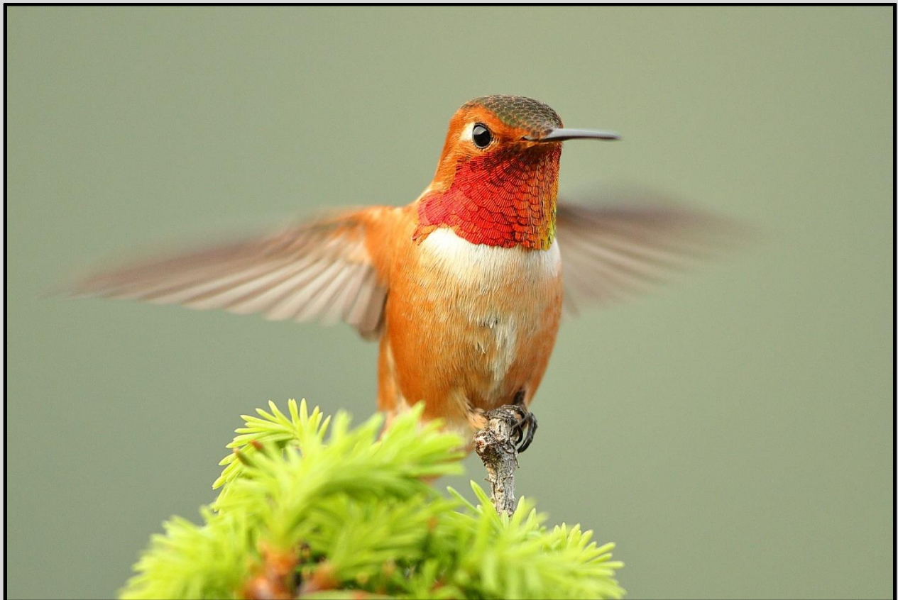
Figure 7 Bright overcast and no wind is perfect for natural light hummingbird photography. Here is a male rufous hummingbird on the ranch owner's deck that you have full access to all week.