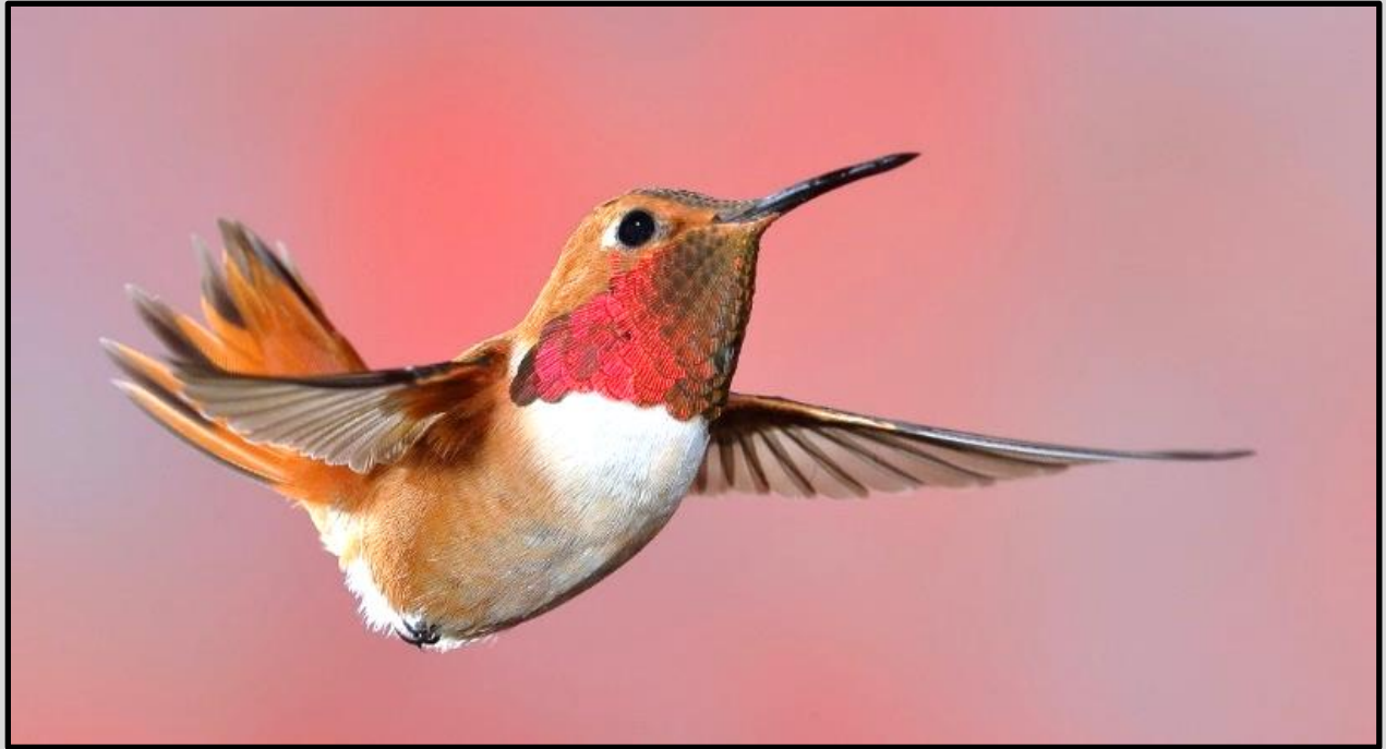
Figure 9 Male rufous hummingbird with four flashes at 1/64 th power.