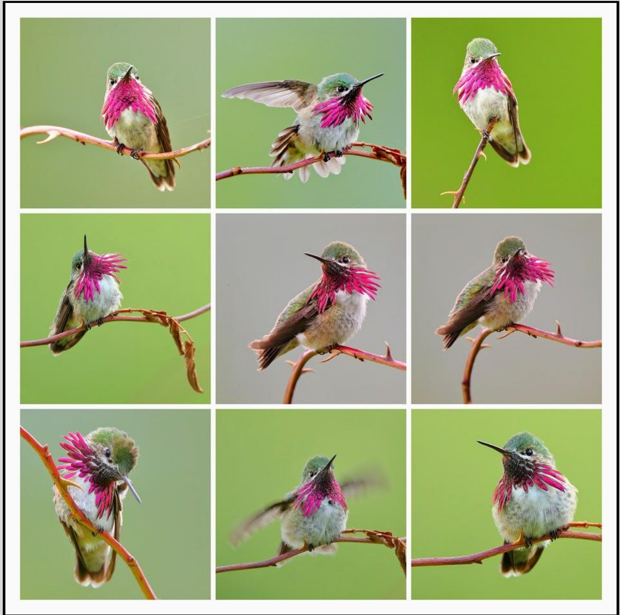
Figure 16 This male calliope hummingbird delighted my groups in 2019. I will regularly check the small group of rose bushes he "owned" to see if he returned so you can photograph him too. All images are made with natural light and a 600mm lens, 1.4x teleconverter, 25mm extension tube, and AF microadjusted to +5. As always, I teach the skills necessary to shoot superb images with flash or natural light!