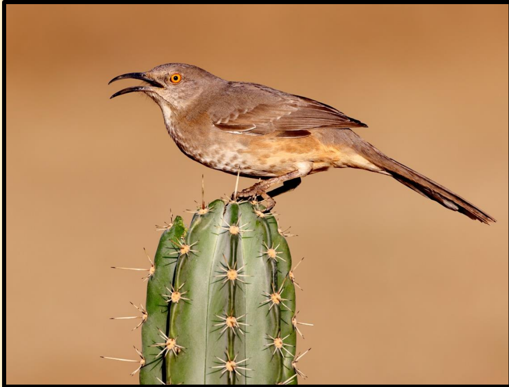
Figure 4 The curved-billed thrasher is a common resident that loves to pose for your camera!