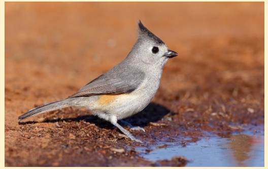
Figure 12 Other birds we expect to photograph include: Golden-fronted Woodpecker, Black-crested titmouse, Common ground-dove, pyrrhuloxia northern cardinal, and Curved-billed Thrasher!