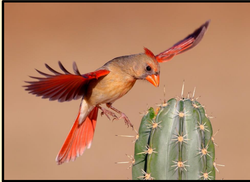
Figure 3 Northern cardinals are common in south Texas and readily attracted to the water and food provided at the ranch. At times, more than a dozen are present at the same time.

We all travel together in our Ford Expedition Max SUV or a rented vehicle. Each morning field trip begins early as we plan to be at the ranch at sunrise when bird activity is high, and the light is superb. We will shoot thousands of images, break for a hearty lunch in Edinburg, and return to the ranch in the afternoon for more photos.