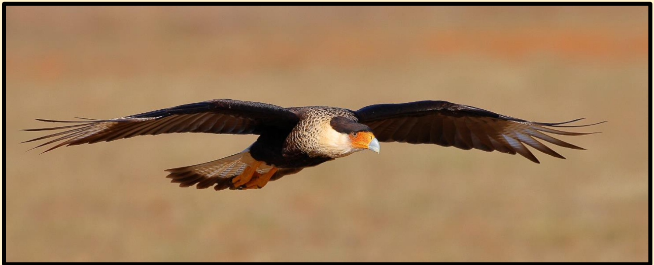
Figure 8 Crested caracaras often squabble with each other.

Examples: Long prime lenses of 500mm and 600mm are excellent for wildlife and work best at the ranch. You can buy a long lens or use teleconverters on a shorter lens. For example, a 1.4x teleconverter used on a 400mm lens gives it the reach of a 560mm lens.