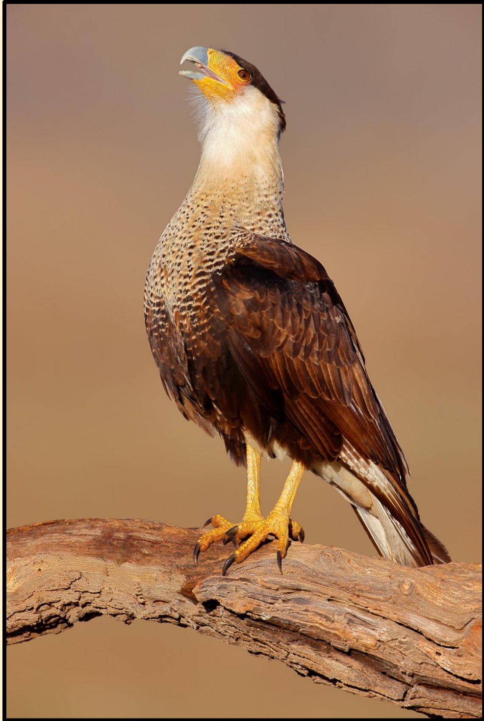
Figure 6 Crested caracaras are animated raptors that are a delight to photograph.