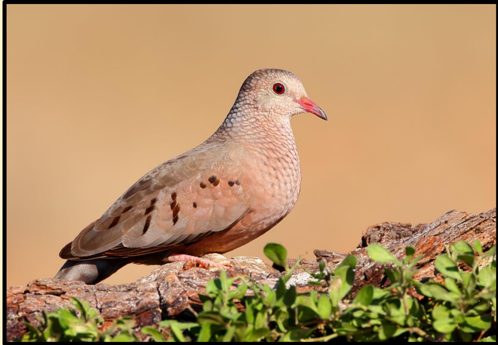
Figure 2 The striking ground dove is a joy to see and photograph!