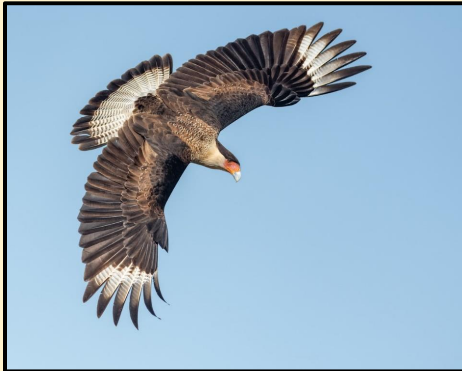
Figure 1 Crested Caracaras are common at the ranch, especially during early March.

(This is Easter weekend but a super time for bird photography)