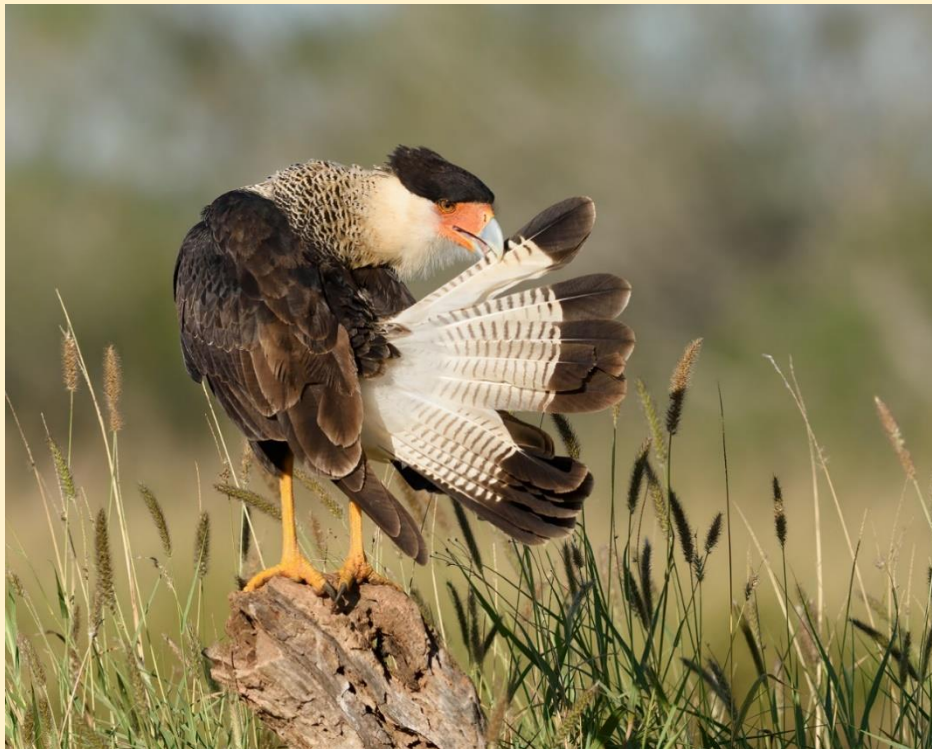
Figure 11 Crested caracara getting ready to be photographed