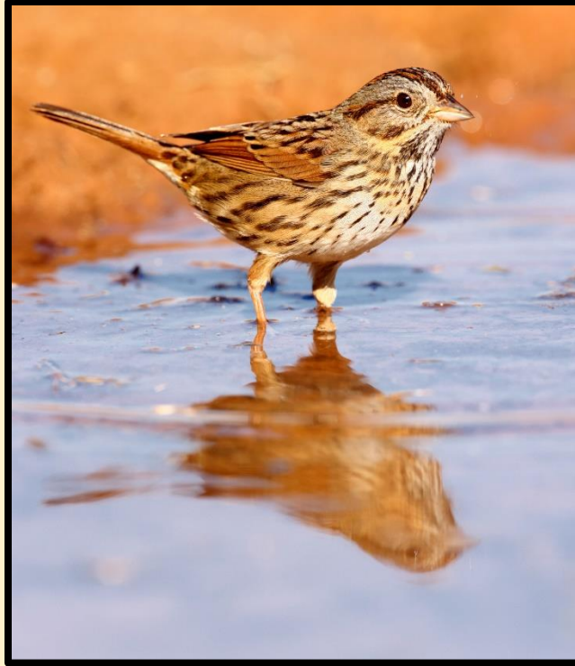
Figure 10 Lincoln's sparrows are frequent at the ponds.