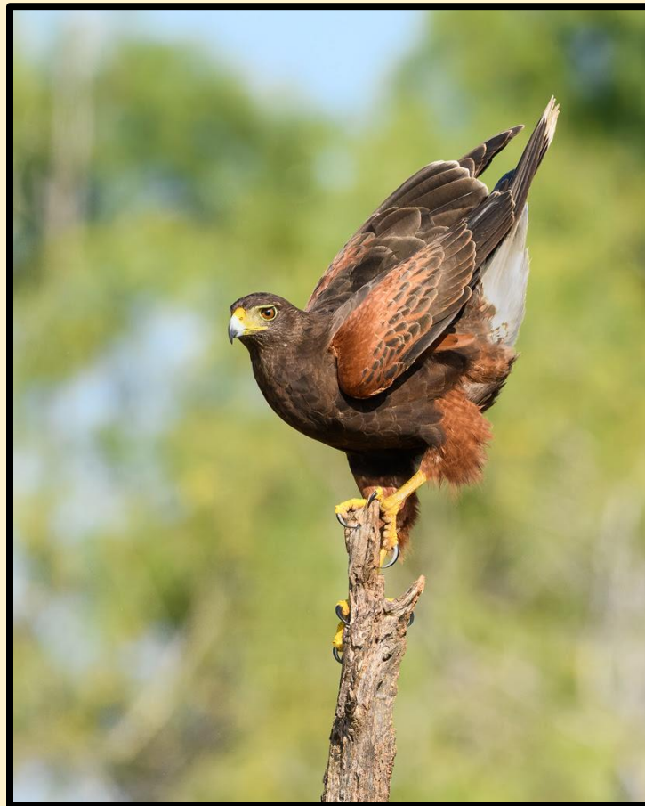
Figure 9 Harris's hawk is often attracted to the raptor blinds.