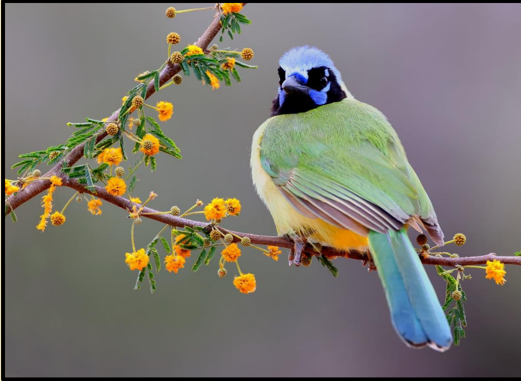
Figure 7 You probably know the blue jay. Did you know another jay called the green jay is common at the Laguna Seca Ranch? They mostly live in Mexico but are abundant along the Texas border.